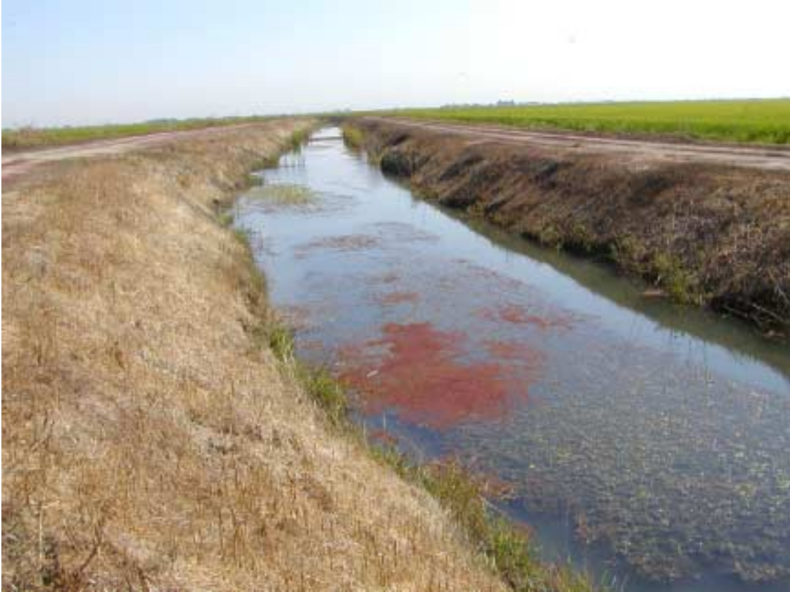
Ditch on Lucich North property