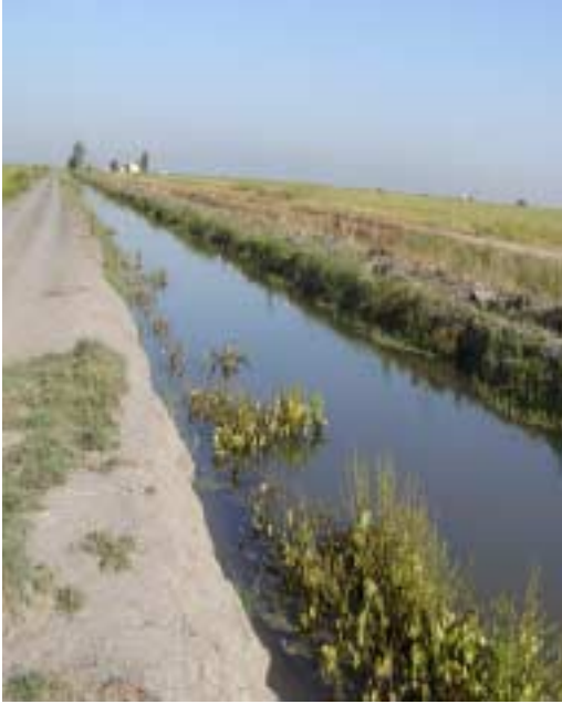
Ditch on east side of Ayala property