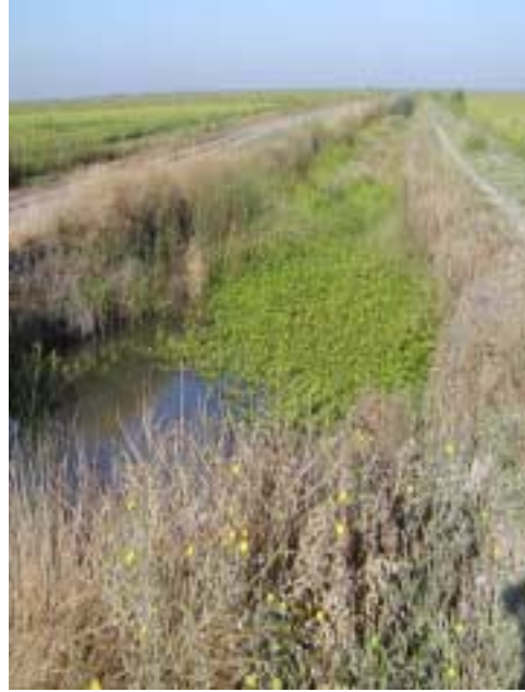
Ditch at south end of property