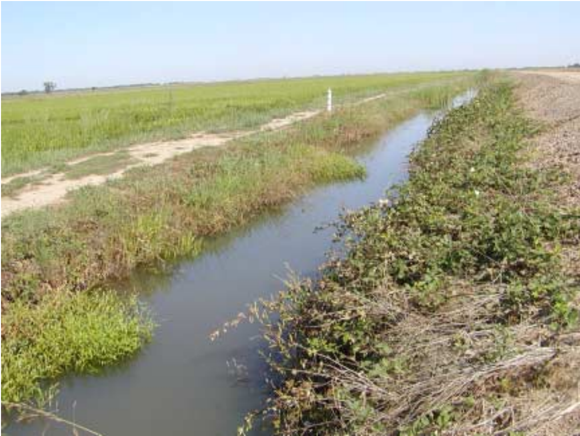
Ditch on Bennett South property.