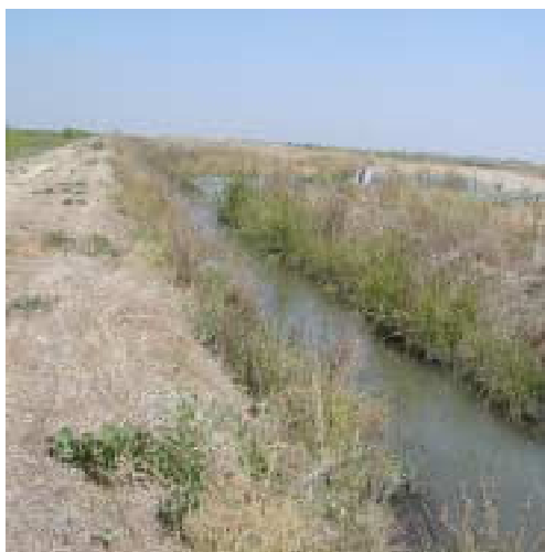
Ditch at west edge of BKS property