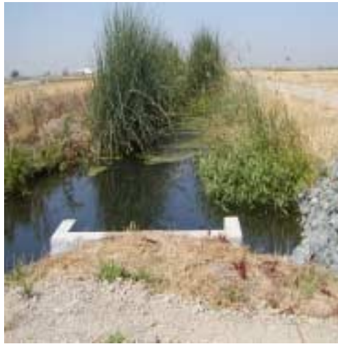
BKS E-W canal adjacent to pond