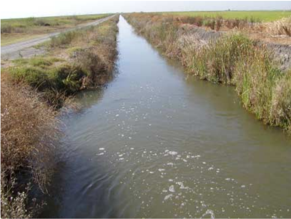
Ditch commonly referred to as Snake Alley.