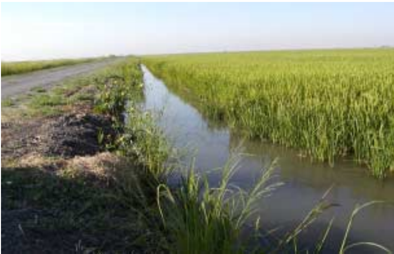
Edge of rice located at west side of Ayala property