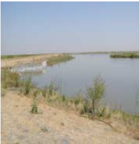
Marsh S-W side of BKS