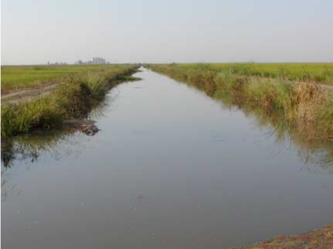
Ditch on Sills Ranch property.