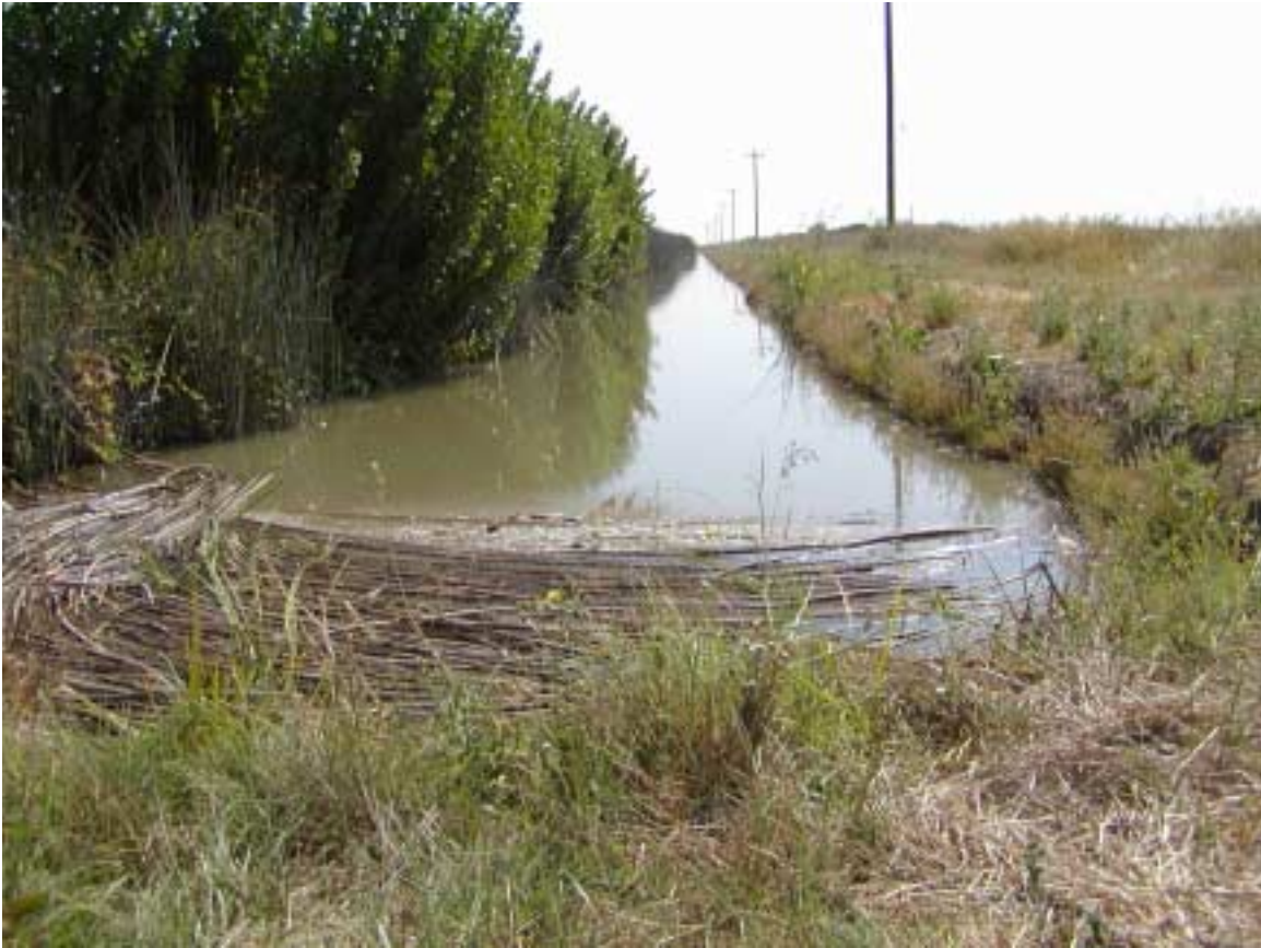
Ditch located on Airport property, adjoining Miester Road.