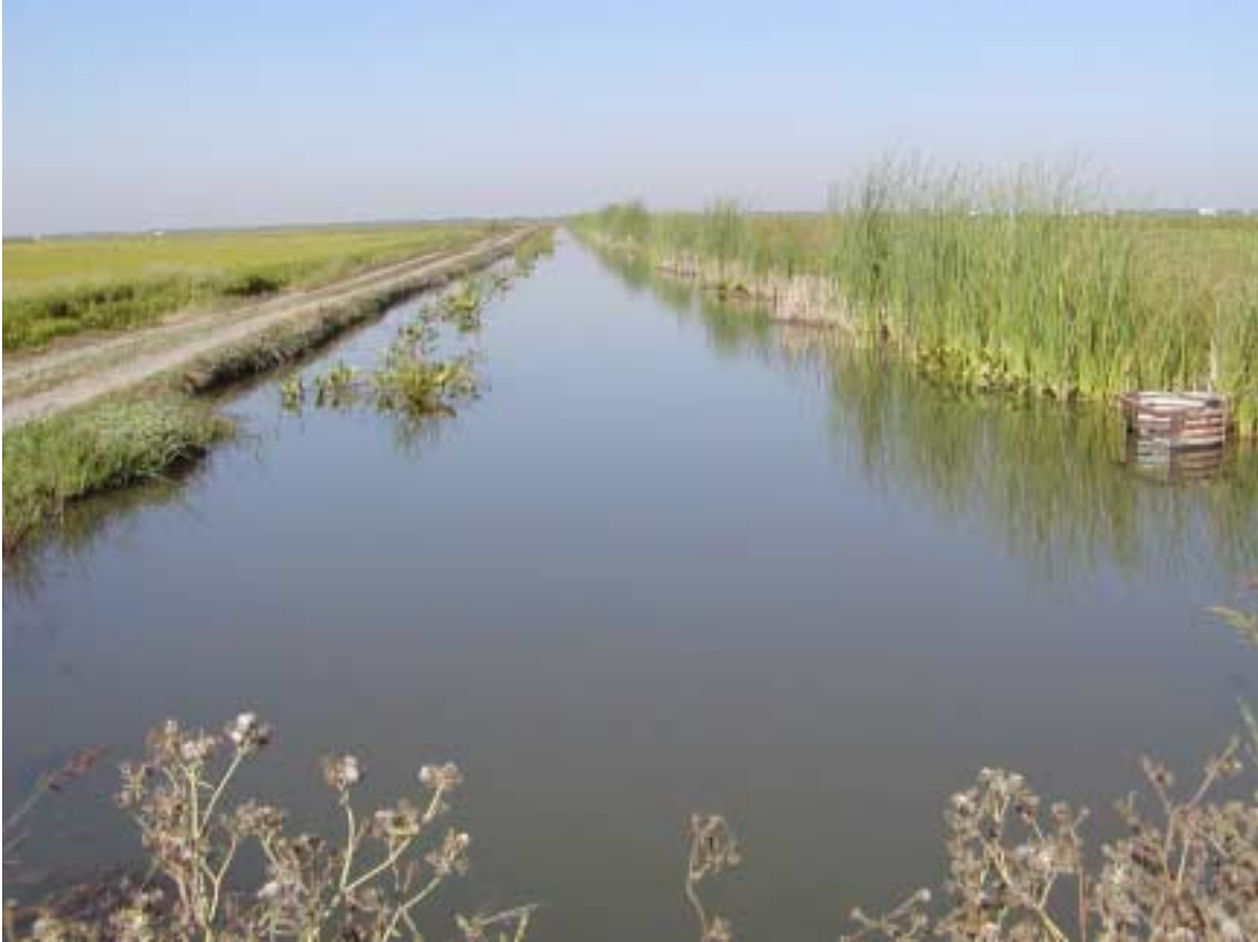
Ditch on NTI property near I-99 and an airstrip.