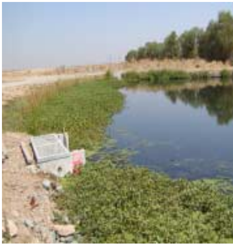
Pond at east side of BKS