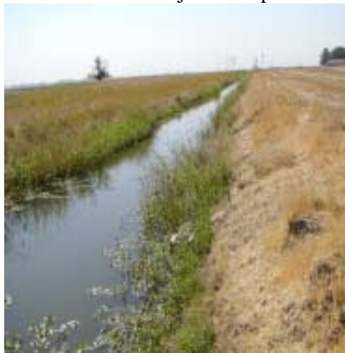
Canal middle of BKS property near house