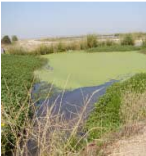
Pond at west end of BKSE-W canal