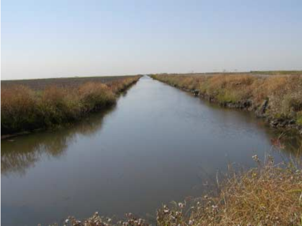
Ditch on Lucich South property.