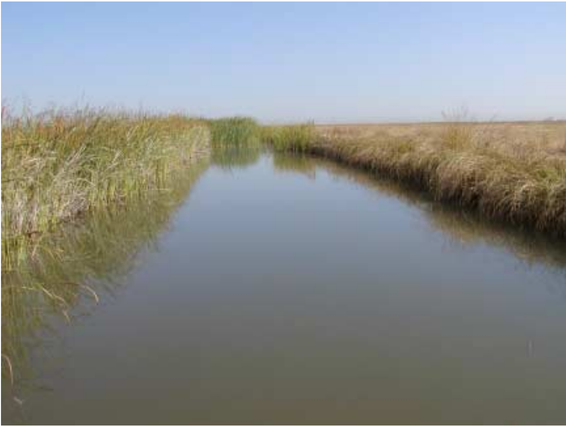
Ditch off of Elkhorn Road.